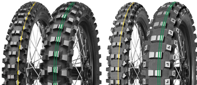
C-21 & C-20 JUNIOR ENDURO